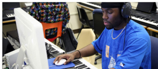
Film & Video Production